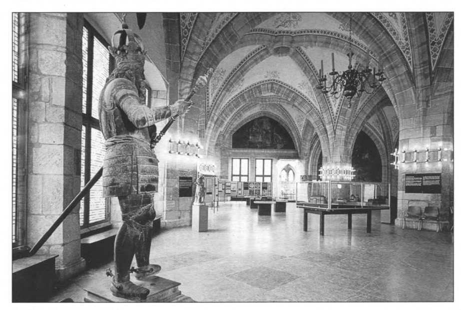
The Krönungssaal in Aachen